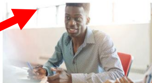
Sign in using ILogin