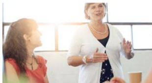
Employer Services Login