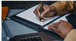
Closed and Awarded IFBs/RFPs