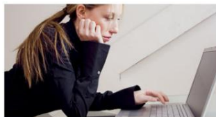
Member Services Registration Instructional Video